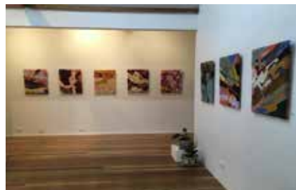
Works by Sophie Honess on exhibition